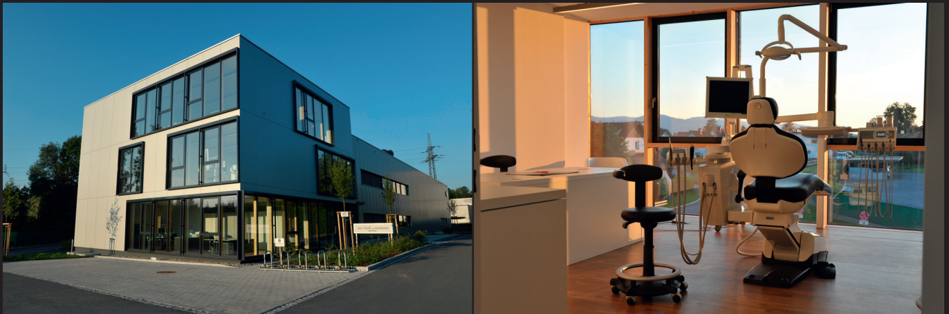
edelweiss headquarter with integrated dental office „smile center“ and workshop facilities.

A certificate of attendance will be provided at the end of the course.