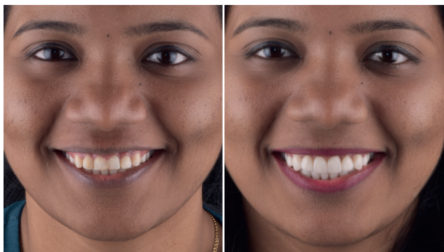
edelweiss non-prep CMD rehabilitation case

edelweiss dentistry welcomes you to their Headquarters in Wolfurt, Austria and invite you to experience a novelty in the dental world. You will experience first-hand expertise from lectures, hands-on work-shops and live patient demonstrations and be able to interact on a one-on-one basis with speakers from all over the world.