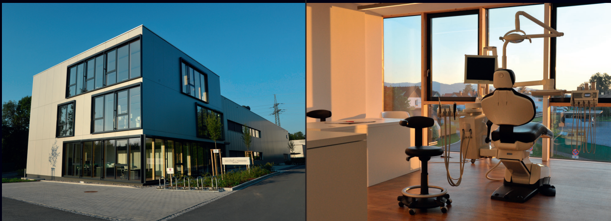
edelweiss headquarters with integrated dental office „smile center“ and workshop facilities.

A certificate of attendance will be provided at the end of the course.